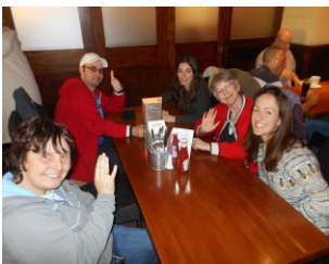
Harry Ramsden's Meal