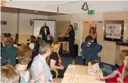
Headway 30 th Anniversary Party

who helped make it a brilliant night – here's to the next 30 years!